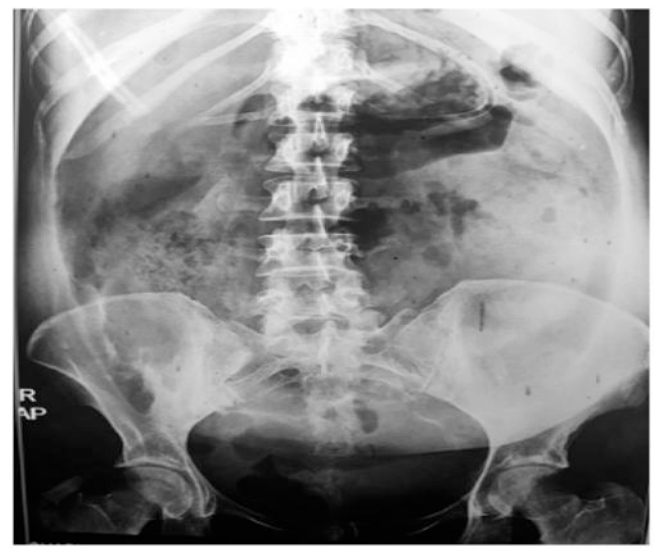
Figure 2: Plain x-ray abdomen showing dilated cecum