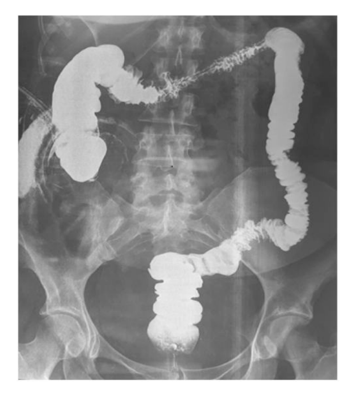
Figure 3: Distal barium loopogram before closure of cecostomy

An emergency exploratory laparotomy was carried out. There was generalized fecal peritoneal soiling. Cecum and ascending colon upto the hepatic flexure were found to be massively dilated. Cecal diameter was about 16 cms, with two 2.5 cm gangrenous and perforated patches on its anterior wall. Thorough peritoneal lavage was done with 0.9% saline. Necrotic patches were excised. This large defect in the cecum was not sutured because of intraperitoneal sepsis and instead it was brought out as a cecostomy. Post-operatively, the patient was nursed in ICU for 2 days and managed with intravenous fluids, antibiotics, analgesics and nutritional support. She was discharged on 5th post-operative day.